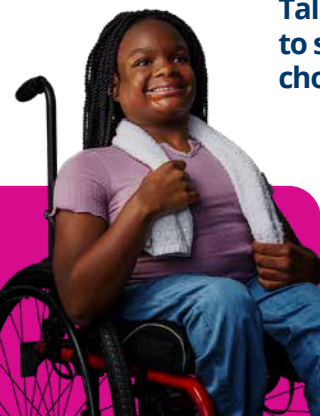
Not an actual patient.

Chronic drooling can be treated with XEOMIN® (incobotulinumtoxinA)