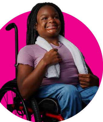
Not an actual patient.

Doctors may suggest using a handkerchief, towel, or bib around your child's neck to help manage the wetness. However, relying on these items alone to manage the effects of drooling may make your child feel self-conscious or isolated. They are not alone; XEOMIN may be able to help!